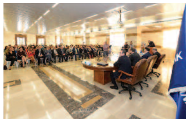
Overview of the event