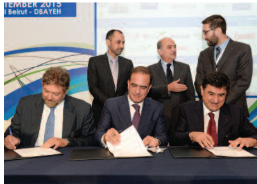
During the signing of the agreement