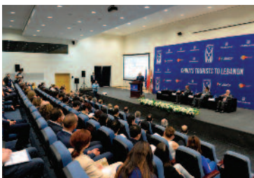
Overview of the Press Conference

During the 8-day FAM Tour, the tour members were amazed by the abundant tourist resources, and well developed hospitality industry in Lebanon, as well as Fransabank's professionalism in organizing events related to China. This project has also drawn the attention from media both in Lebanon and China through 2 articles from Xinhua News Agency who covered the FAM Tour.