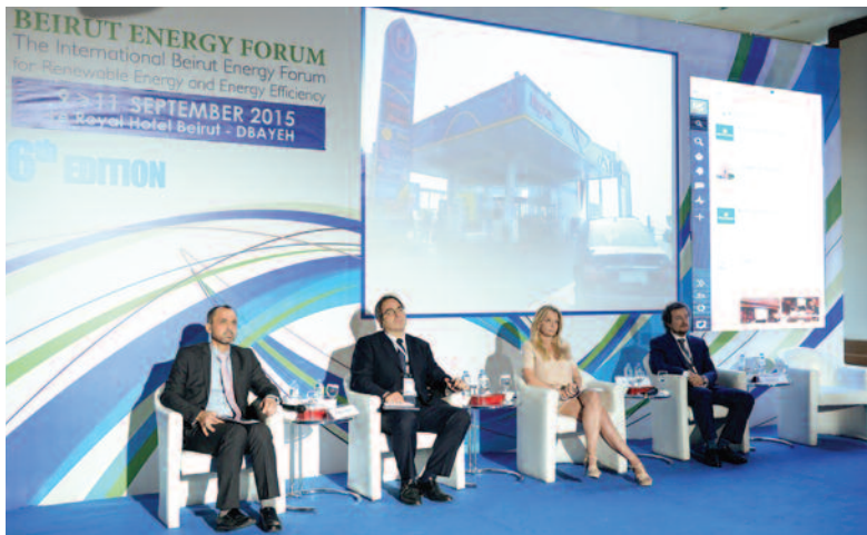
The speakers on podium

efficiency and renewable energy measures. The 3 projects were successfully implemented and the clients expressed their satisfaction with Fransabank's team, the knowledge and expertise they provided, and the substantial financial reward this product offered to their businesses.