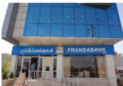
Fransabank Erbil Branch

To Fransabank, the event represented an area of significant discussions ranging from the Bank's International Expansion, its experience in Iraq with its two branches in Erbil and Baghdad, to the challenges that Lebanese banks are facing today in the Iraqi market.