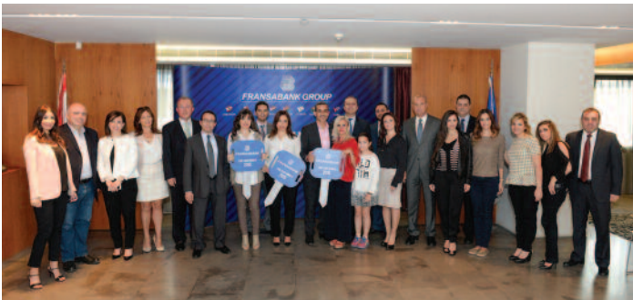
The Winners with Fransabank's Team