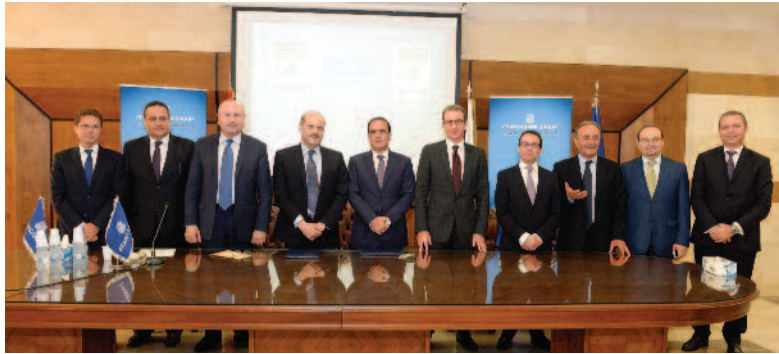
Group picture after the MOU signature