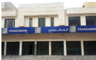
Fransabank Baghdad Branch

The Forum was held with the participation of the Governor of the Iraqi Central Bank and a group of Iraqi, Lebanese and Arab bankers in addition to heads of Heads of banking and financial institutions, experts, economists and representatives of specialized media outlets.