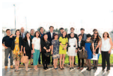
Representatives of Chinese Travel Agencies visiting Lebanon