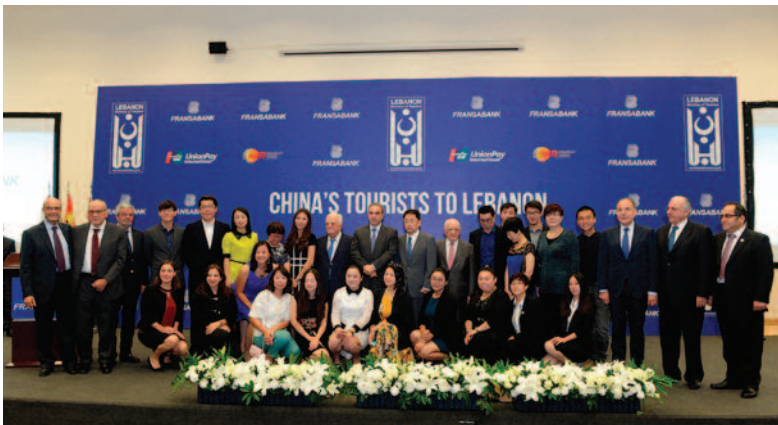
Chinese Delegation with the speakers